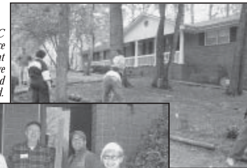
Alpharetta UMC Great Day of Service Volunteers at Denna Drive where they landscaped the front yard.

We would like to let all of these volunteers know how much their volunteering for the "Great Day of Service" meant to RRA. THANK ALL OF YOU SO MUCH!