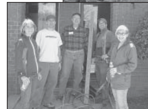
Peachtree Road UMC Great Day of Service Volunteers at Grimes Place, where they built a wheelchair ramp for the front doors.